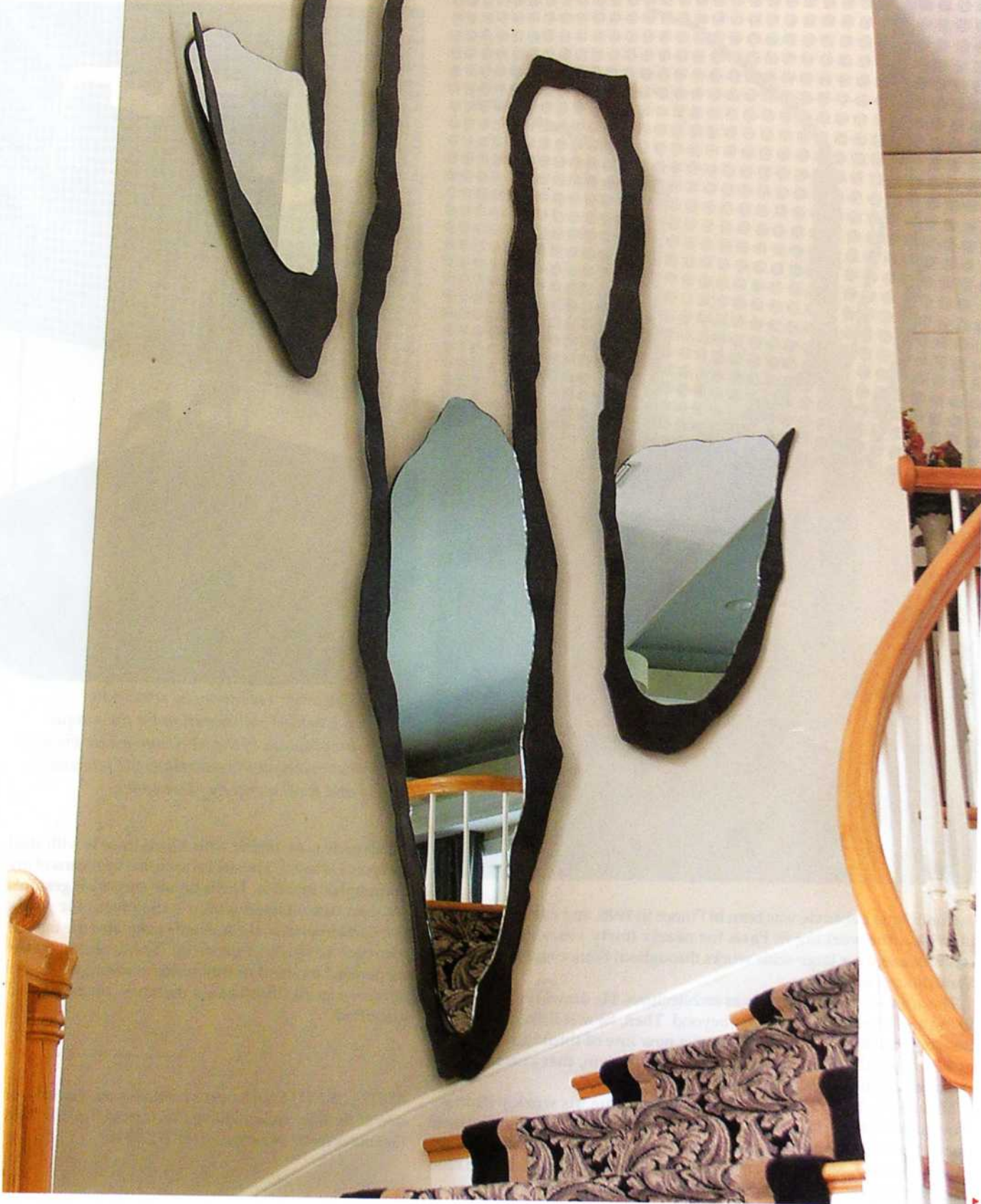
"The Poet's Mirror" was created by Labauvie for a family's home in Belleair.